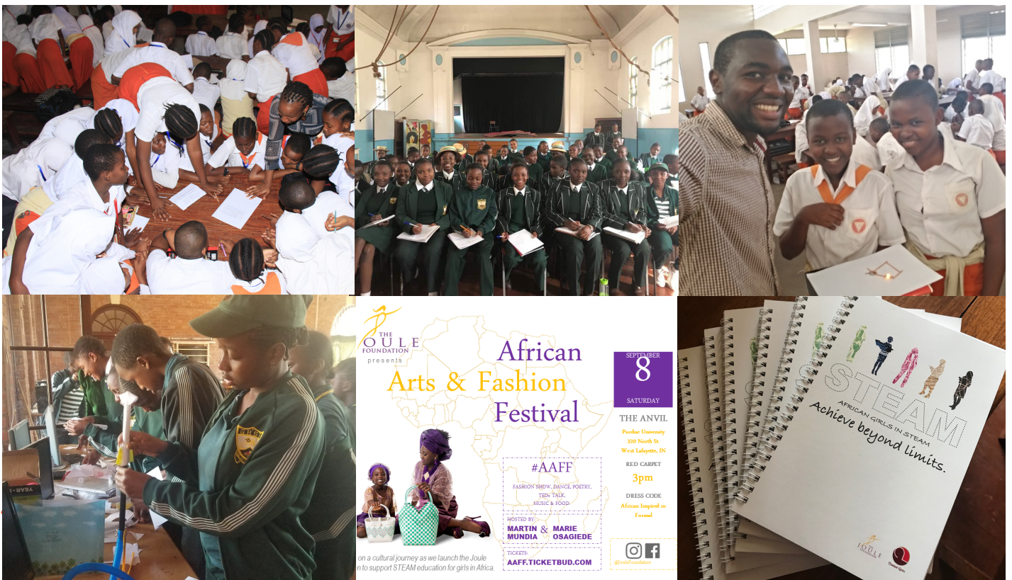
Top left - Students in Tanzania working with an Architect during a career panel workshop to brainstorm ways to solve a local problem. Top Center - Students in Zimbabwe during a virtual workshop with speakers on live video displayed on a projector. Top Right - Students in Tanzania show off their electrical circuits design workshop accomplishment. Bottom Left - Students in Zimbabwe design a paper rocket during a workshop. Bottom center -Purdue University Launch fundraiser flyer. Bottom right - Student journals